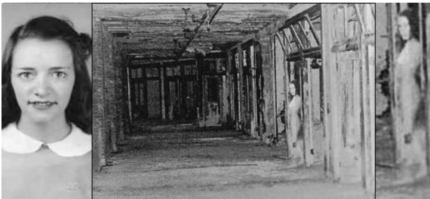
Photo of the nurse that took her own life at Waverly Hills in Room 502, and a photo of the full-bodied apparition which appears to match her physical characteristics. This photo was uploaded via Reddit, and the original photographer is unknown. This is considered one of the best photographic pieces of evidence of paranormal activity at Waverly.

Waverly Hills on Wikipedia: https://en.wikipedia.org/wiki/Waverly_Hills_Sanatorium