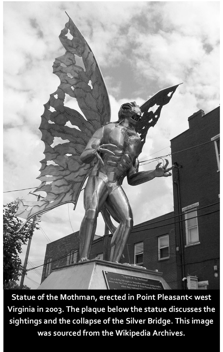
Statue of the Mothman, erected in Point Pleasant, West Virginia in 2003. The plaque below the statue discusses the sightings and the collapse of the Silver Bridge.

Unfortunately, we do not have enough information to make that determination. The fact that the large increase in sightings before the collapse of the bridge may have been caused by hoaxers and/or misidentification, combined with the fact that the Mothman hasn't returned to Point Pleasant or been