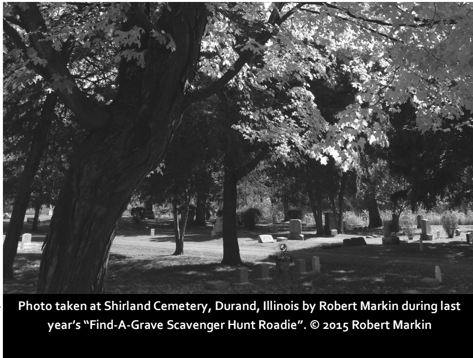
Photo taken at Shirland Cemetery, Durand, Illinois during last year's "Find-A-Grave Scavenger Hunt Roadie".

For more information, visit www.findagrave.com