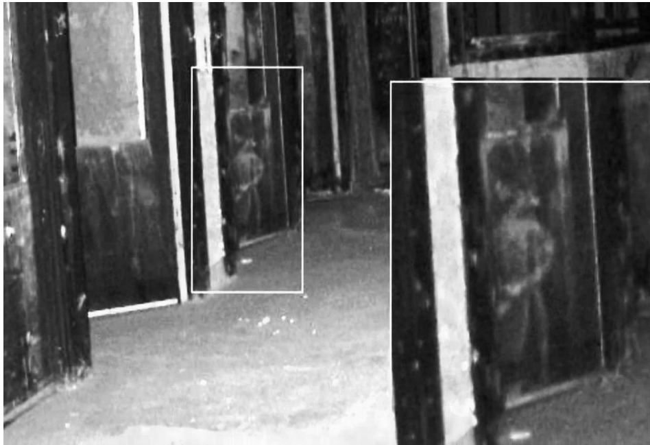
Alleged photo of the little ghost girl taken by a visitor to the location. This photo was uploaded via Reddit, and shows what appears to be a smoky-like apparition of a small, child-like form.

The ghost of a little girl has been seen and heard multiple times by various witnesses. It was even believed to be photographed once (see photo this page). Some investigators have even recorded EVPs that contain the voice of what sounds like a little girl talking, and a toy ball has been seen to roll around and/or move on its own accord.